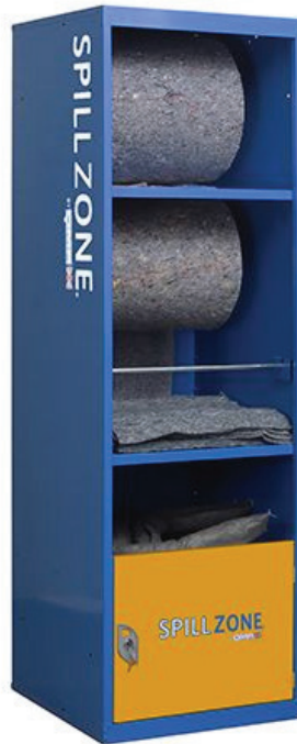
Lockable cupboard for absorbents