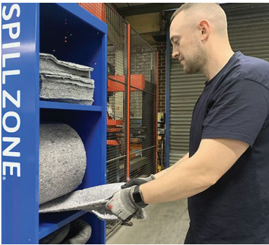
Bottom cupboard for replenishing stock